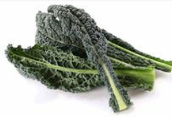
Ingredient of the week: kale