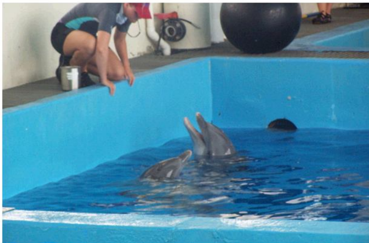
Famous resident, Winter the Dolphin, with friend getting a treat at the Clearwater Marine Aquarium.

The activities are boundless. A few of my favourites included riding bikes along the beach-line, riding the waves on a jet ski, para-sailing above the crystal-blue water, dolphin watching on a dinner cruise to fishing excursions for the whole family.