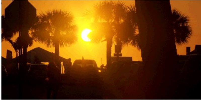
Sunset in Clearwater

Sand and sensational food make this a must-visit Florida destination