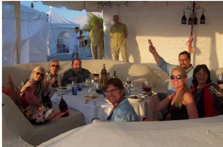
Dinner in the Sand with friends during Sugar Sand Festival in Clearwater.

First, I'm sitting down for a dinner in the sand – literally. My table and seat are constructed entirely out of sand. I'm being served a five-course meal by the Hyatt's SHOR American Seafood Grill – and it's spectacular.