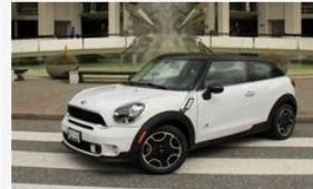
Road test: 2013 Mini Paceman S All4