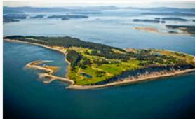
Gallery: James Island, B.C. for sale – US$75M