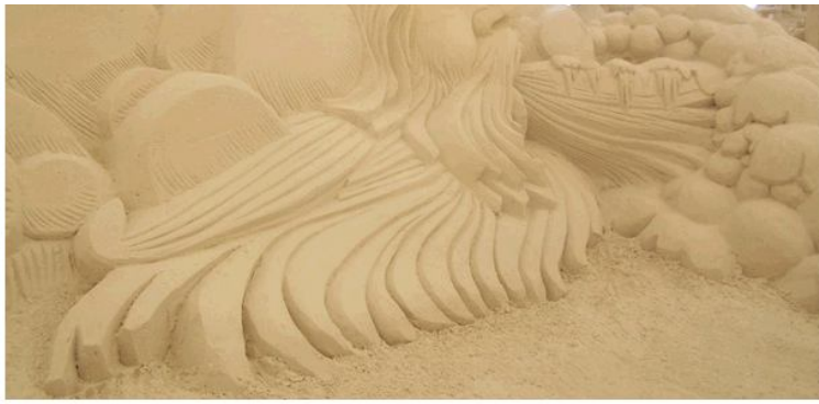
One of the amazing sand sculptures at the Sugar Sand Festival in Clearwater.

It's also probably why it was recently voted Florida's best beach town by USA Today .