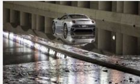
Gallery: Floods cause chaos on Toronto streets