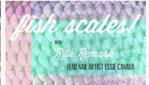
Video: Strange Inspirations — Summertime nail art